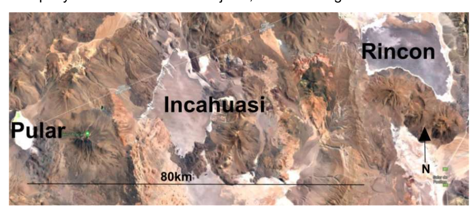
Figure 1 - Pular, Rincon and Incahuasi Projects

PepinNini Lithium Ltd (PNN, PepinNini, the Company) is pleased to report that geophysical contractor Quantec Geoscience has commenced a geophysical Time Domain Electromagnetic(TEM) survey on the Company's Incahuasi Project. The salar is located midway between the Company's Rincon and Pular Projects, shown on Figure 1.