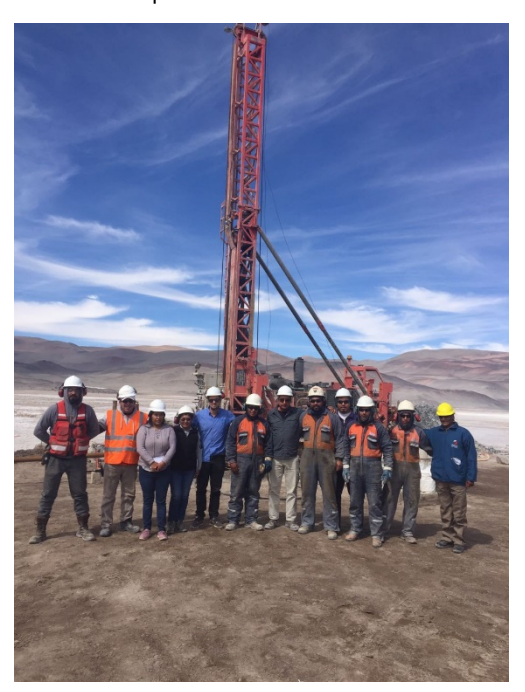
Figure 2 - Community Visit to Pular Project

Attendance at community meetings continued to maintain communication and understanding of the field activities and community members were welcomed to visit field operations to ensure understanding and good relations. The employment of local community members in field positions continued.