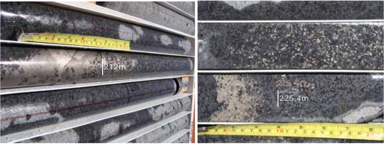
Massive and disseminated sulphides Borehole DD07HAR008

Core samples have been dispatched to a laboratory for analysis and down-hole electro magnetic (DHEM) surveys of drill holes at the Harcus Prospect have been completed and the data is currently being assessed.