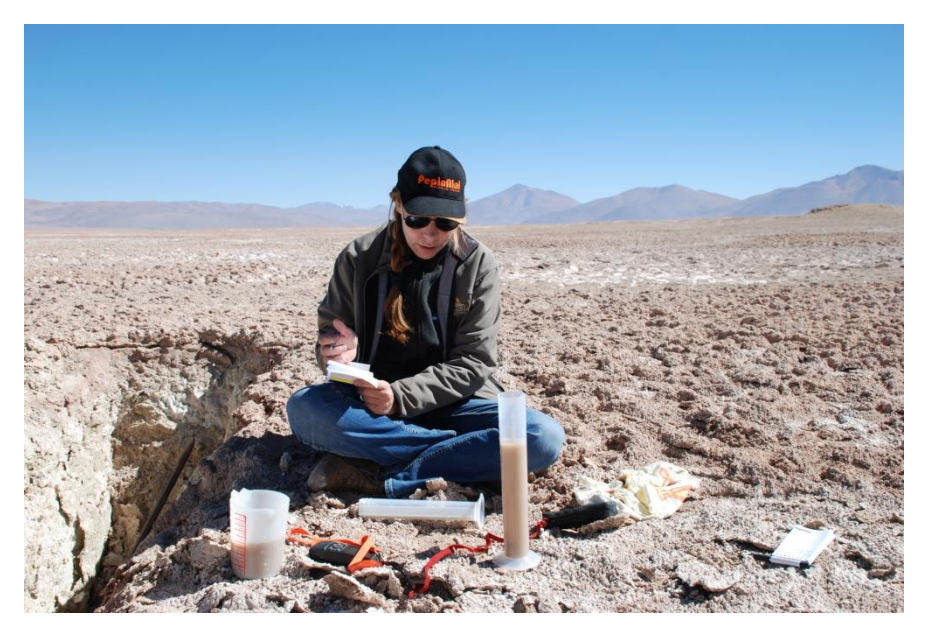
Figure 3 - Brine sampling Salar Pocitos - September 2016

The survey results will be used to plan the next stage of exploration which would be drill testing or trench sampling depending on groundwater aquifer depths. Complete results from preliminary sampling undertaken in August and September are expected before the completion of the VES program.