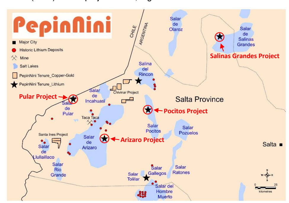
Figure 1 - VES Geophysical Survey Locations - Lithium Project - Salta Province, Argentina.

PepinNini exploration team based in Salta and geophysical contractor Tecnologia y Recursos are undertaking the program over 8 mining leases(mina) of four project areas, Figure 1.