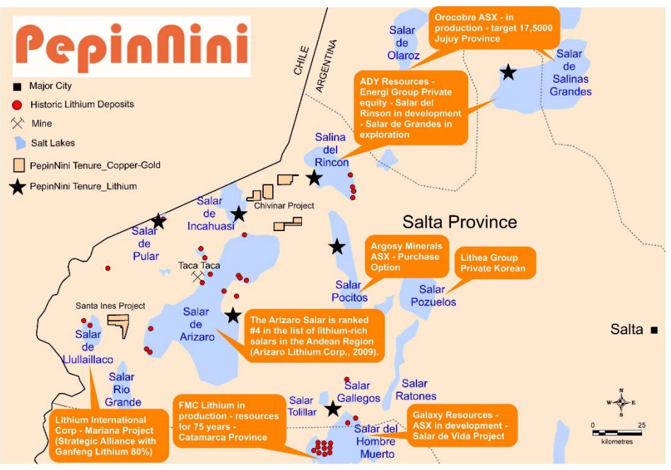
Figure 1 - Lithium Exploration Activity Salta Province, Argentina.

"PepinNini is well positioned to identify lithium deposits suitable for production in the medium term".