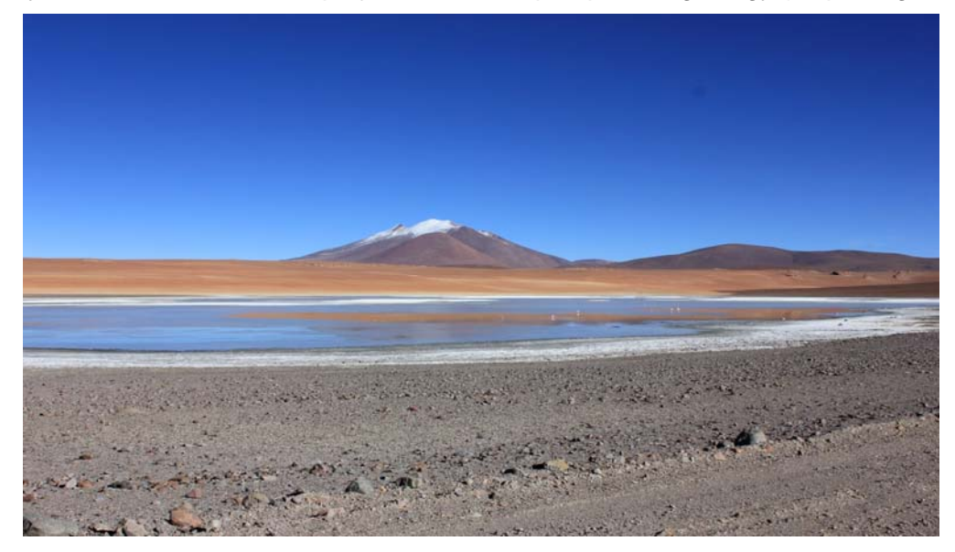
Figure 2: Historically lithium-brine mined salar, Salar de Pular

All eight minas are located either near historic lithium occurrences (marked as red spots on Figure 1) or in the vicinity of current lithium brine projects and over prospective geology (as per Figure 2).