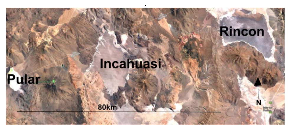
Figure 2 - Pular, Incahuasi and Rincon Lithium Projects