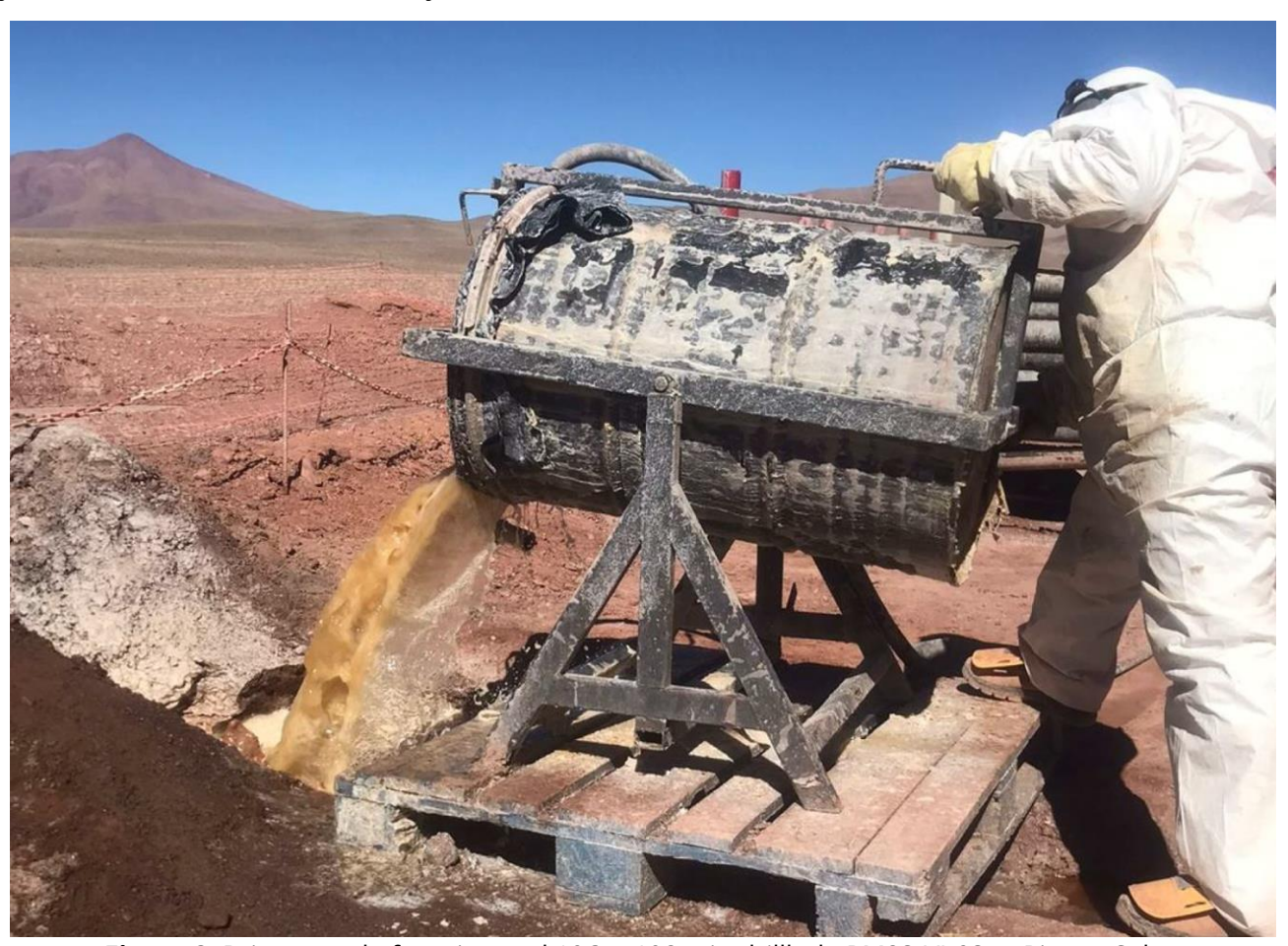
Figure 2: Brine sample from interval 196m-198m in drillhole PM23-VI-03 at Rincon Salar.

Power recently completed drilling at its first target, the Incahuasi salar, and the results delivered a maiden JORC Mineral Resource at Incahuasi, which adds to the total JORC Mineral Resource at the Salta Project (ASX announcement, 23 May 2023).