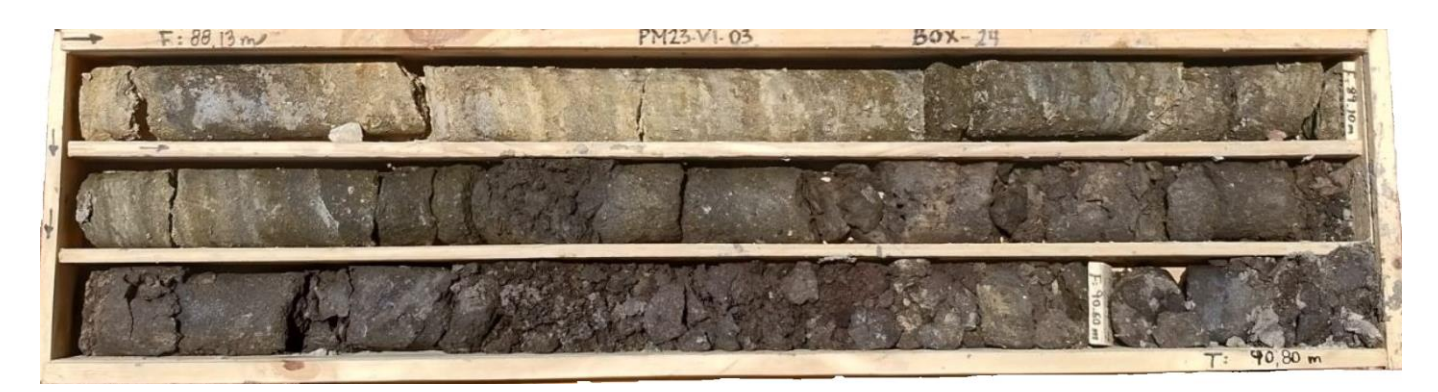
Figure 3: Core from interval 88.6m-90.6m in drillhole PM23-VI-03 at Rincon Salar.