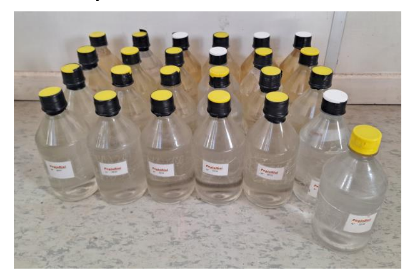
Figure 2: Lithium brine samples (500ml bottles) from drillhole PM23-VI-02 sent for laboratory assay tests

Power recently completed drilling at its first target, the Incahuasi salar, and the results delivered a maiden JORC Mineral Resource at Incahuasi, which adds to the total JORC Mineral Resource at the Salta Project (ASX announcement, 23 May 2023).