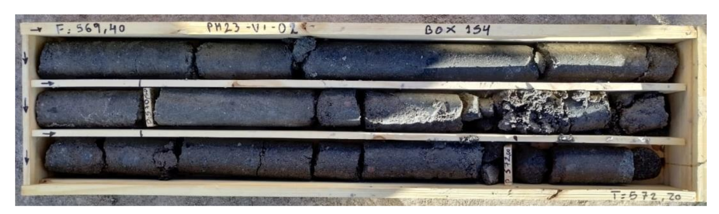
Figure 3: Drill core from 569.4 to 572.2 metres depth in drillhole PM23-VI-02 at Rincon salar (Note: high core recovery and sandy matrix)