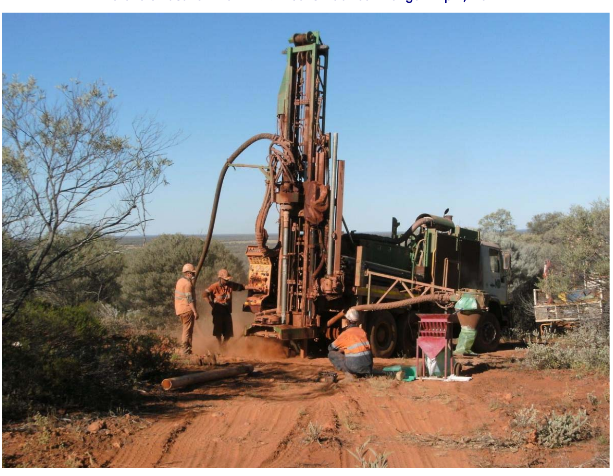
Drilling Robinson Range Iron Ore Project – February, 2012