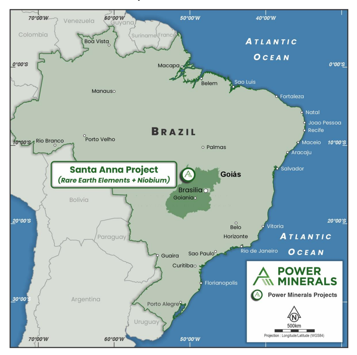
Figure 2. Santa Anna Project location map in Goiás State, central Brazil.

Given these uncertainties, no one should place undue reliance on any forward-looking statements attributable to the Company, or any of its affiliates or persons acting on its behalf. Subject to any continuing obligations under applicable law, the Company disclaims any obligation or undertaking to disseminate any updates or revisions to any forward-looking statements in this announcement to reflect any change in expectations in relation to any forward-looking statements or any change in events, conditions or circumstances on which any such statement is based.