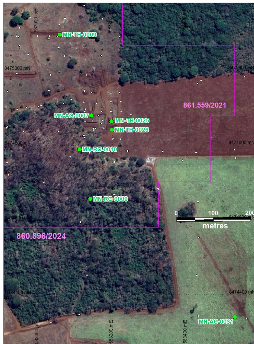
Location of EDEM drillholes with recent ALS pulp analyses.