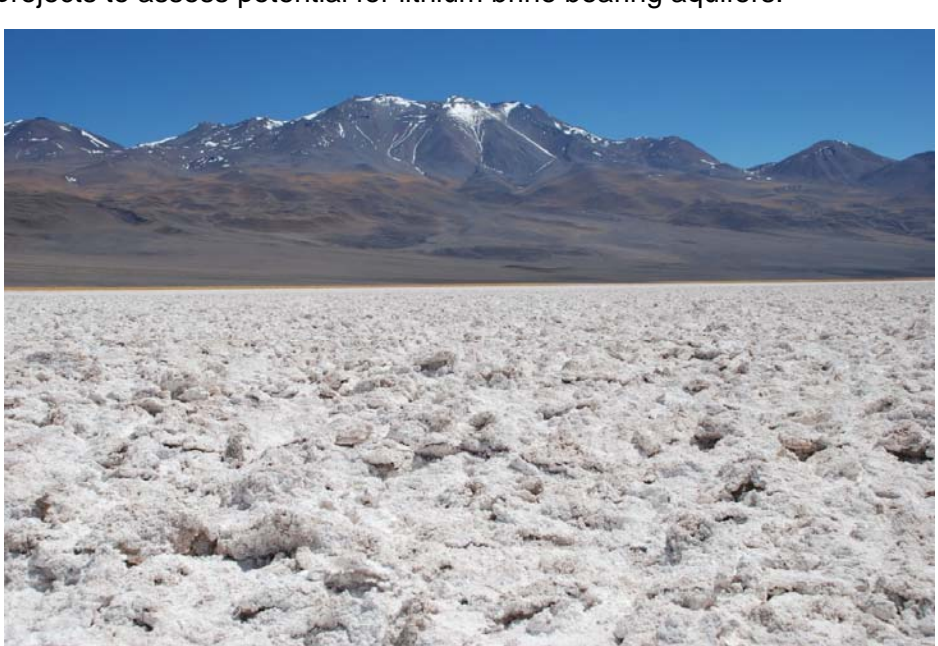
Salar de Pular - Drilling Planned for September

Geophysical surveys will be undertaken on the Rincon and Centenario projects to assess potential for lithium brine bearing aquifers.