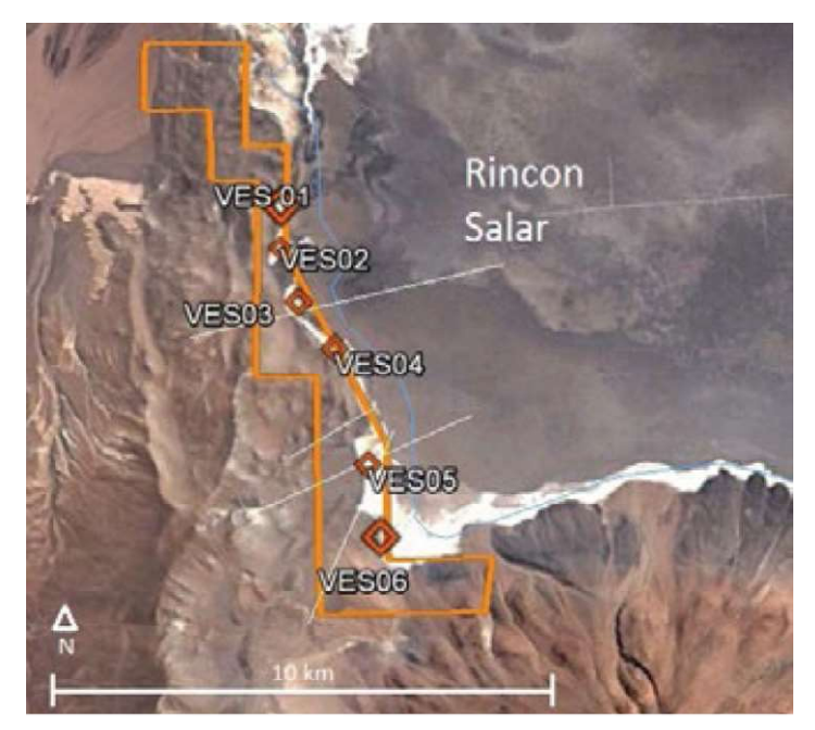
Figure 1 - Geophysical Survey Traverse Location – Rincon Salar