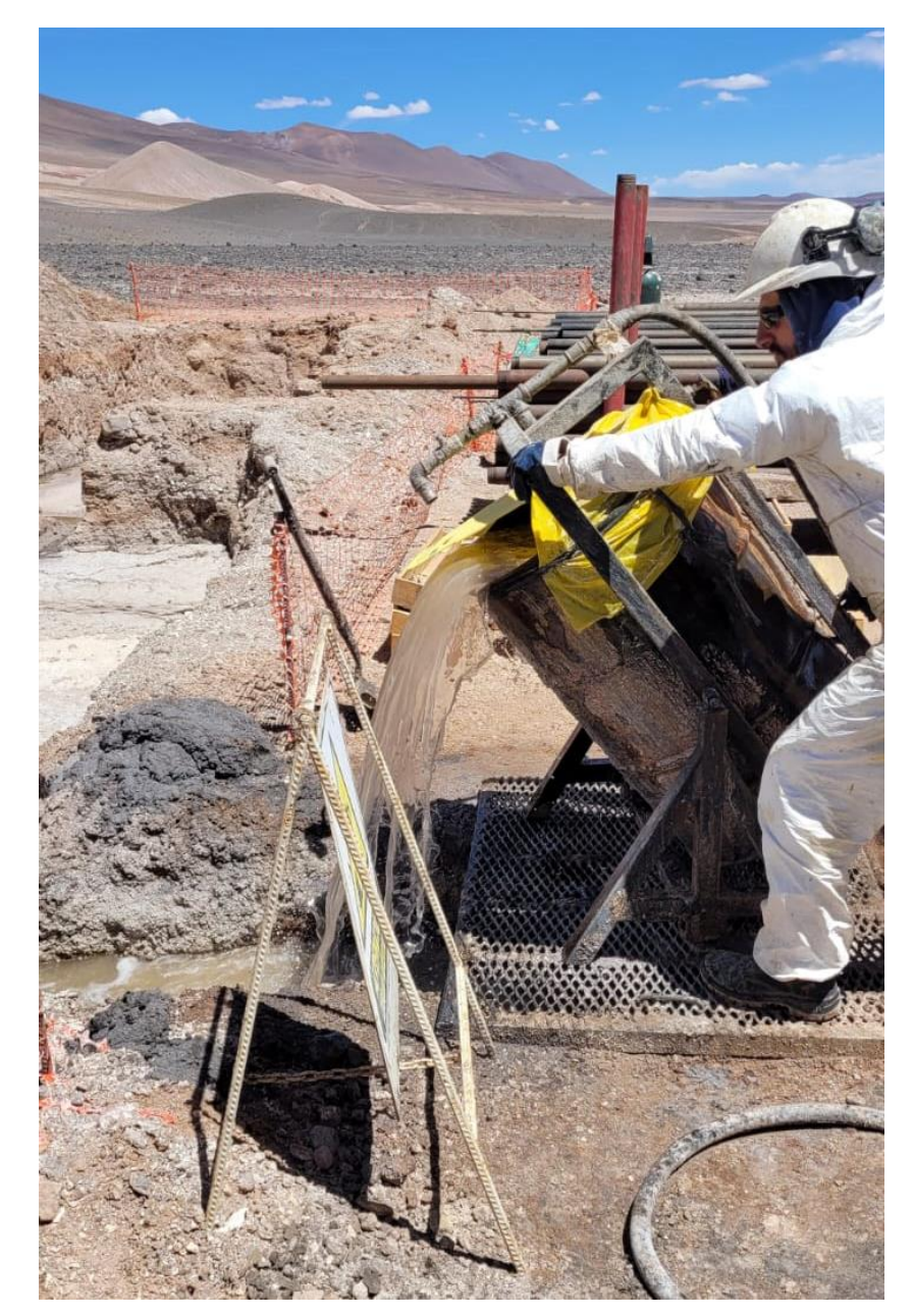
Figure 2: Brine sampling from drillhole PM23-IN-03 at the Incahuasi salar, Salta Lithium Project.