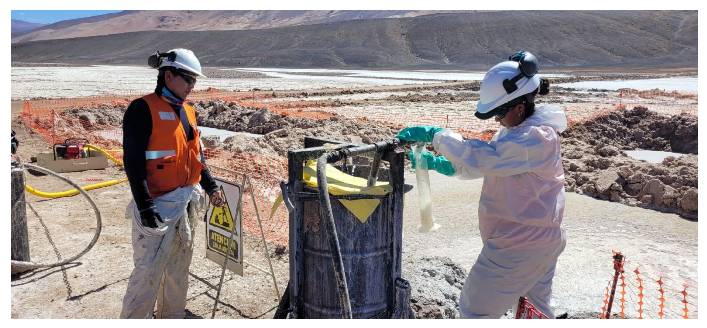
Figure 1: Brine sampling from drillhole PM23-IN-03 at the Incahuasi salar, Salta Lithium Project.

Drilling has successfully confirmed this outcome. The results indicate similar and consistent lithologies to the first two completed drillholes of the program, PM22-IN-01 and PM22-IN-02 (ASX announcements, 14 February 2023 and 12 January 2023), and enhance Incahuasi's Mineral Resource potential.