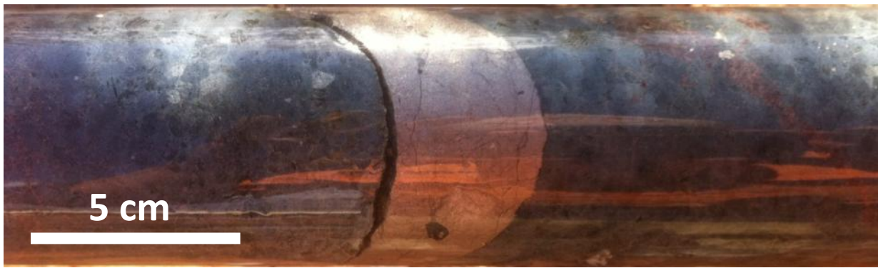
Figure 1: DD12COP015, Vein of massive pyrrhotite cross-cutting the fabric of a felsic gneiss (162.5m depth)