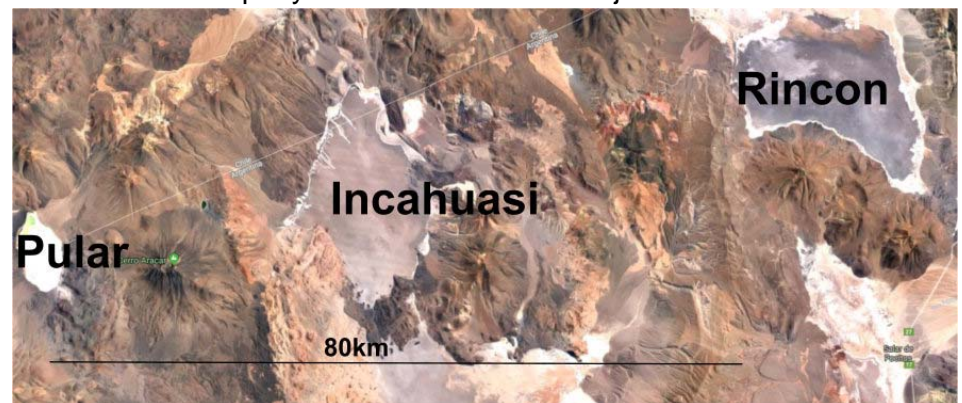
Figure 1 - Pular, Rincon and Incahuasi Projects

The Company plans exploration drilling, targeting a Lithium Carbonate(LCE) resource on the salar. The salar is located midway between the Company's Rincon and Pular Projects.