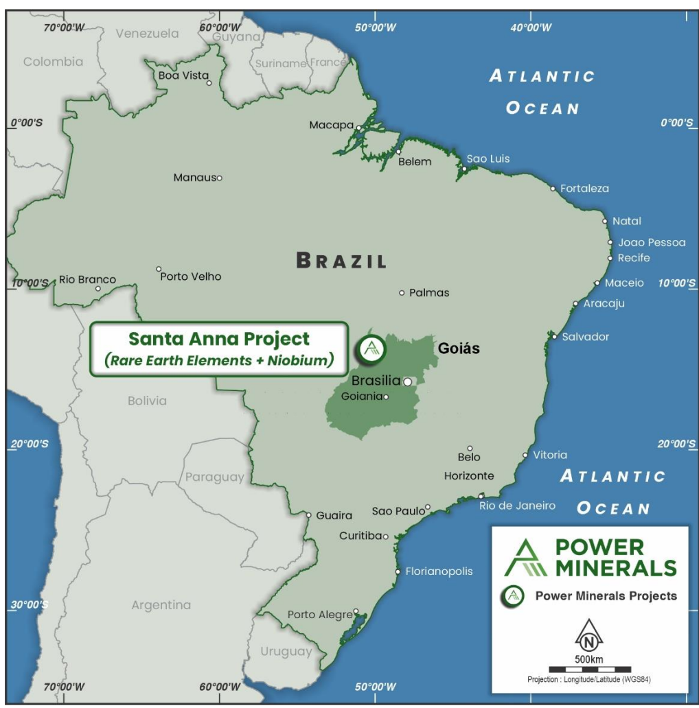
Figure 2. Santa Anna Project location map in Goiás State, central Brazil.