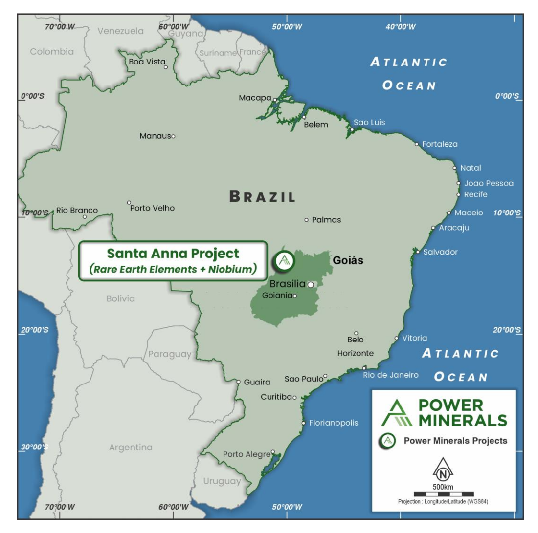
Figure 1. Santa Anna Project location map in Goiás State, central Brazil.