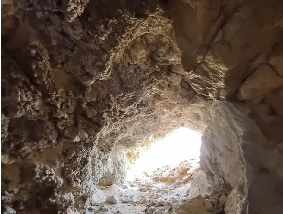
Figure 2: Artisanal working sampled by P0973-24 (refer to Table 1).

“These are exciting results from our first-pass sampling program and confirm that high-grade niobium-tantalum-REE mineralised pegmatites are also present within our Tântalo Project. The results have provided a strong level of initial confidence in the Project’s exploration potential. Power plans to undertake a maiden drilling program at both Projects as soon as possible.”